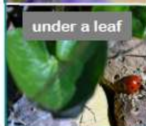
under a leaf