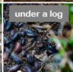
under a log