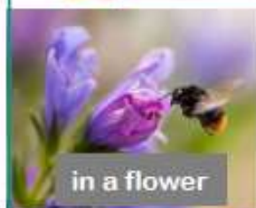
in a flower